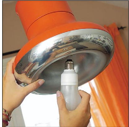
Replacing light bulbs